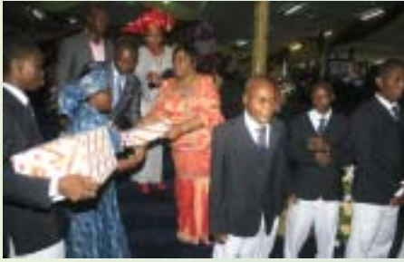
❖ Bishop Peace presenting gift items to a representative of Betheseda Home for the Blind.