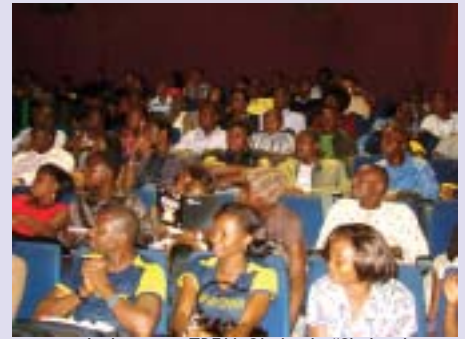
Audience at TREM Obalende "Shake the Shackles" programme