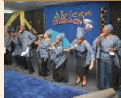
❖ Evangel voices ministering during African Shabach

The Minister laid emphasis on giving to God, stating that investment in the kingdom of God is a condition for settlement. According to him, many do not know that giving is the key to open doors, prosperity, abundance, achievement and many more. ■