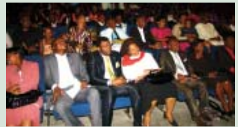
❖ A cross-section of pastors at TREM obalende during "shake off the shackles" programme.

While speaking with the Dunamis Publications reporter during the 2010 annual synod of the Redeemed Evangelical Mission he maintained that the convention had to be biennial to allow the young people in the church to hold their own convention the following year. With this arrangement the financial burden will be less on them,