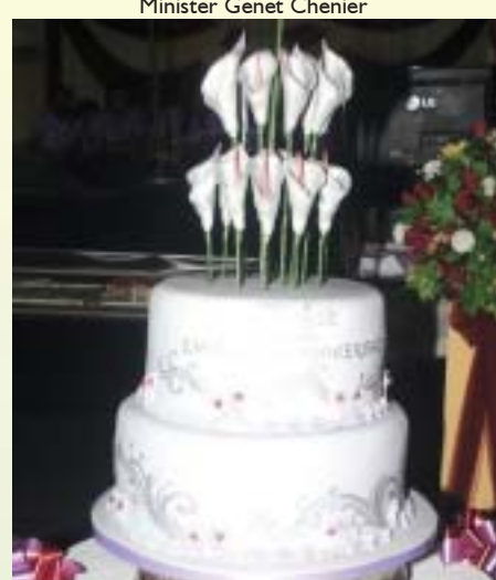
❖ 21st edition anniversary cake of EWAMC 2010