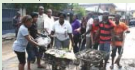
❖ Members of TREM Akoka during the street cleaning exercise