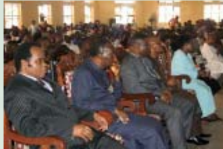
❖ College of Bishops at TREM Ijesha "Open Heavens" 2010 programme