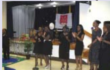
❖ The choir at TREM Maryland, USA ministering at "The Champions conference 2010. he cited include, the story of Jephthah who though was thrown out by his brothers, eventually became a leader and David who killed Goliath.

"Are you in any situation where you don't understand God? Are you in any situation where you have financial needs? Are you in a situation where your health is falling you? Then see God in that situation and see beyond the surface", the man of God charged his audience. ■