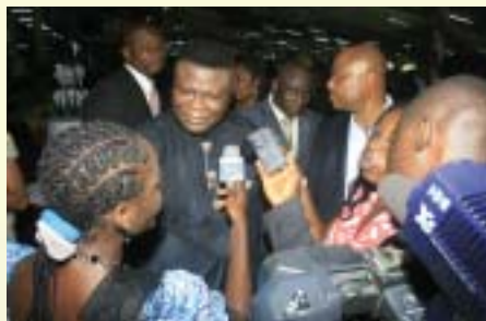
❖ Presiding Bishop answering questions from journalists after the EWAMC 2010 conference