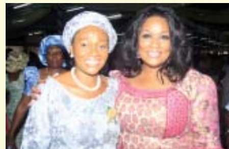
❖ Chief (Mrs) Oluremi Tinubu in photograph with Minister Genet Chenier