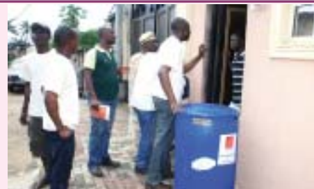
❖ Members distributing refuse bins to residents of Afolabi brown street.